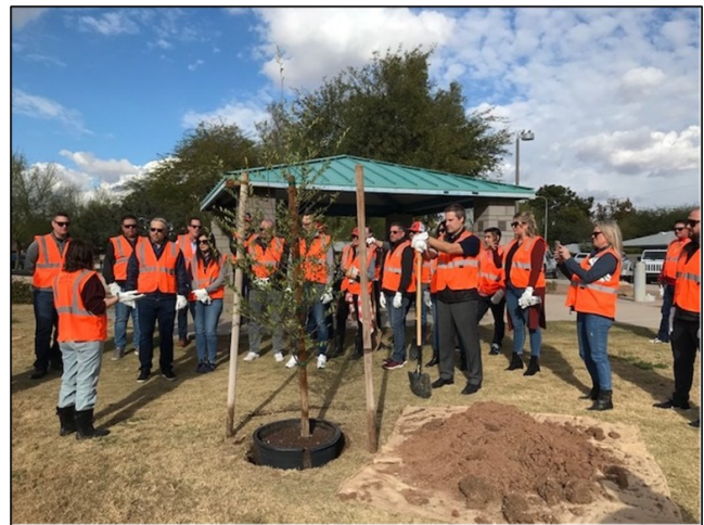
ABOVE: Planting event with Proof Media Mix at Hudson Park

Winter is a busy time as the team inspects the parks and conducts structure pruning for newly planted trees (two to three years in the ground) and replaces trees that have been lost in years past. Additional time is spent training the newly hired staff on equipment safety and efficient operating procedures. It is also a good time for planting, and the team is supporting our Living Tree Donation and Cost Match Tree Programs.