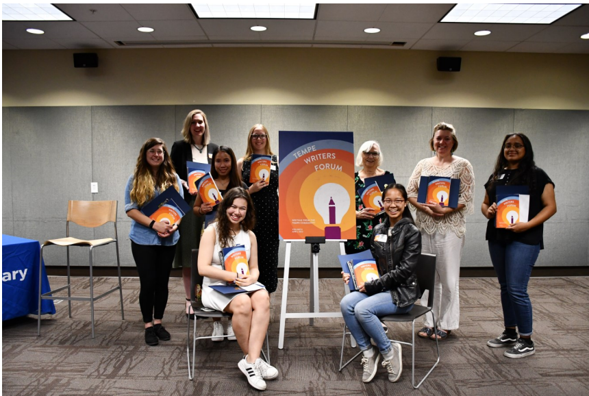
LEFT: 2022 Writing Contest Winners

All previous anthologies are available for check out from Tempe Public Library.