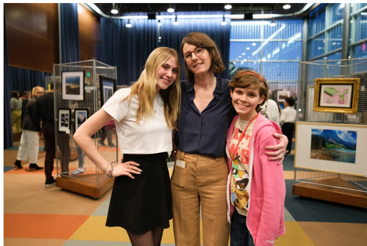
ABOVE: MARCOS DE NIZA TEACHER AND STUDENTS