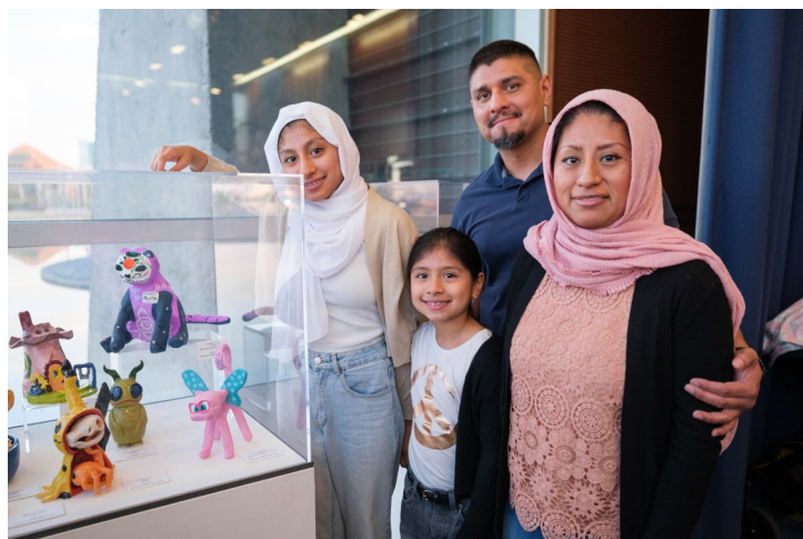
ABOVE: MOUNTAIN POINTE STUDENT AND FAMILY

A total of 115 students presented work in a variety of media including photography, painting, drawing, graphic design and ceramics. The exhibition is made possible by nineteen dedicated teachers who have worked tirelessly to mentor and inspire students.