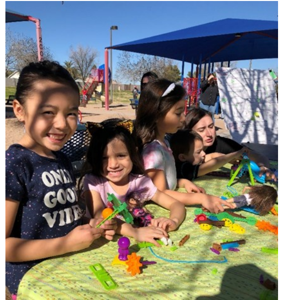
Above: Families building a playground at the Optimist Park Arts in the Park event

We are moving into comprehensive community outreach in April as we draft initial analyses and findings.