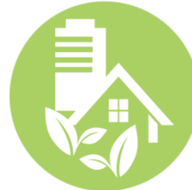
Sustainable Growth and Development