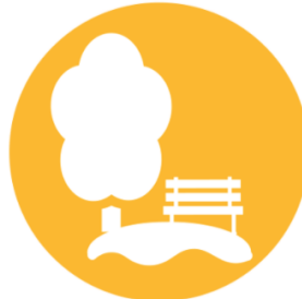
Quality of Life