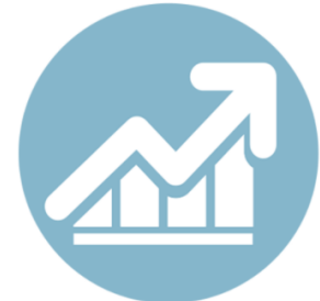
Financial Stability and Vitality