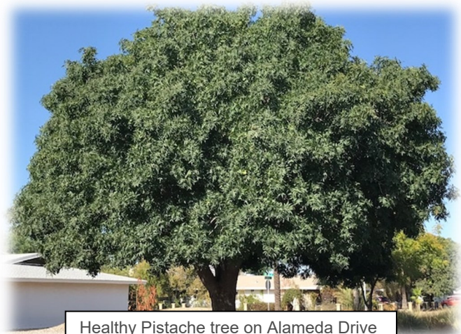
Healthy Pistache tree on Alameda Drive