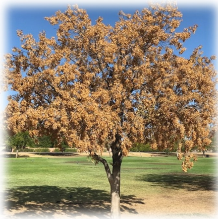
Declining Ash tree in Waggoner Park