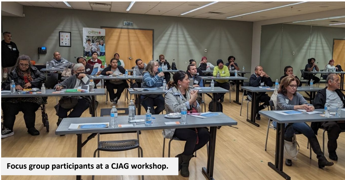
Focus group participants at a CJAG workshop.

After the conclusion of the workshop series, public meetings will be held with at large Tempe residents to present and gather feedback about the proposed Energy Equity Roadmap. Feedback from the larger public meetings will be used to add to and enhance the recommended investments. After the public engagement phase, the finalized Energy Equity Roadmap, including findings and recommendations, will be presented to City Council.