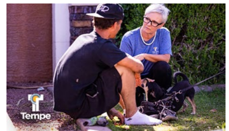
Point-in-Time homeless street count in Tempe

The regional count found that the number of unsheltered people in Tempe decreased from 406 to 266. Read more at tempe.gov/EndingHomelessness .