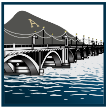
TEMPE TOWN LAKE 25th-Silver Anniversary