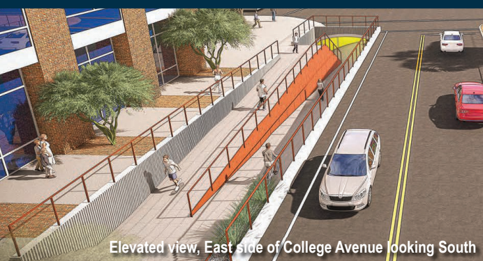
Elevated view, East side of College Avenue looking South