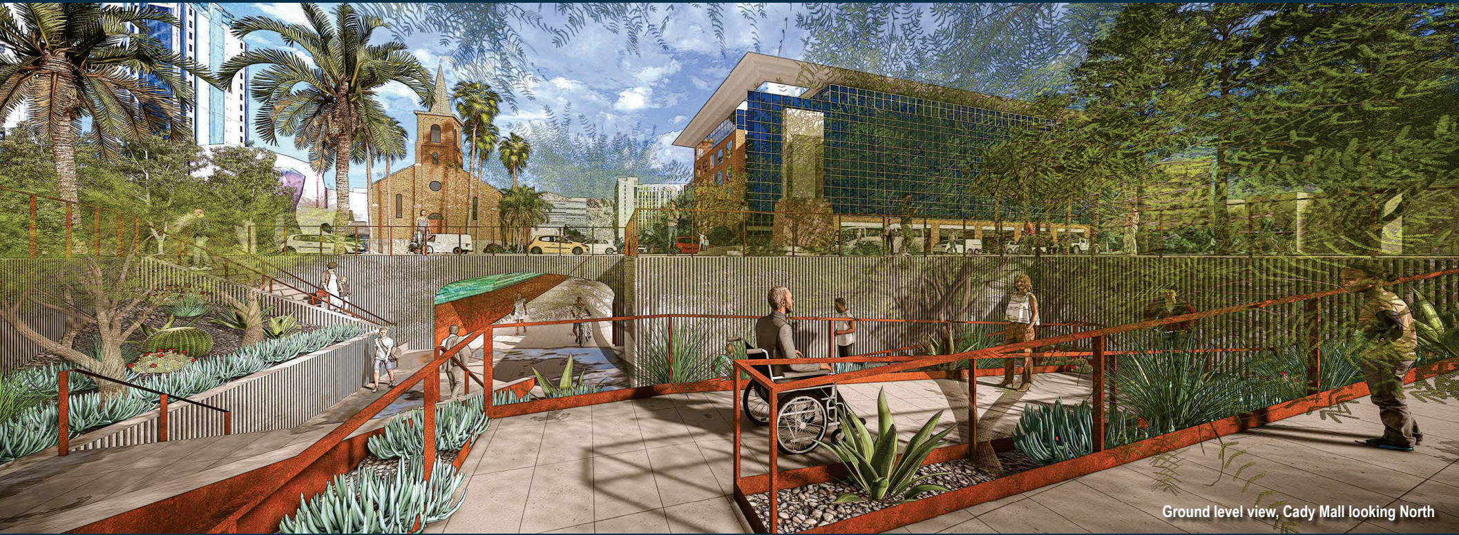
Ground level view, Cady Mall looking North