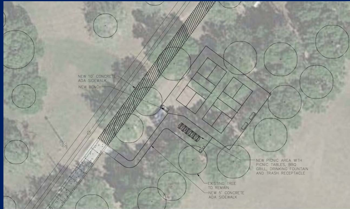
SVOB PARK LAYOUT PLAN 'C'