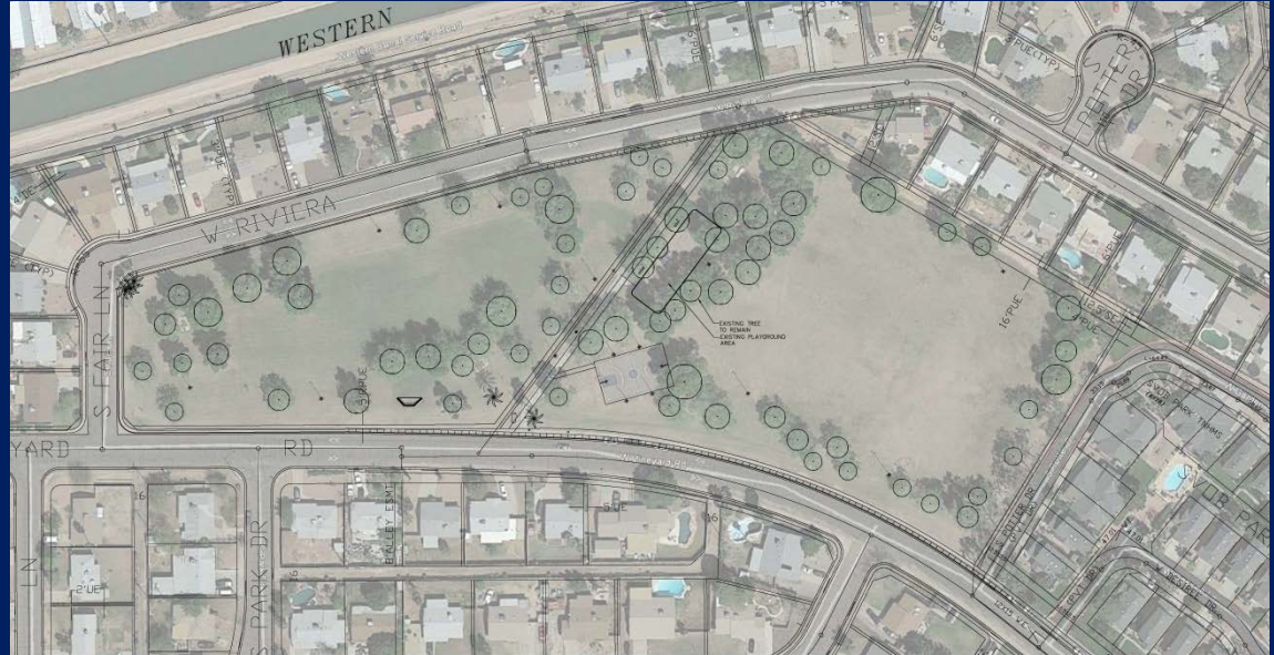
SVOB PARK SITE PLAN