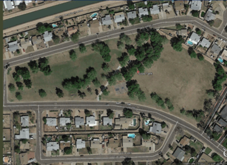
Svob Park Improvements