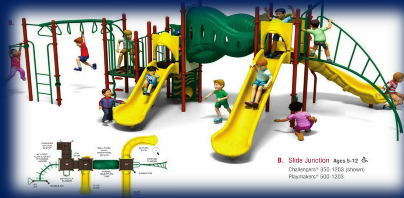
B. Slide Junction Ages 5-12 & Challengers® 350-1203 (shown) Playmakers® 500-1203