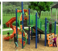
PLAY STRUCTURE OPTION 'B'