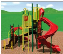
PLAY STRUCTURE OPTION 'A'