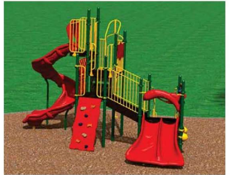
PLAY STRUCTURE 'A'