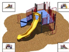
PLAY STRUCTURE OPTION 'C'