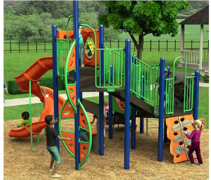
PLAY STRUCTURE OPTION 'B'