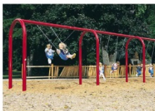
ARCH BAY SWING