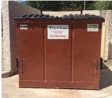
Proper Waste Management

The official start of Monsoon 2018 was June 15 th and will last through September 30 th . Monsoon is defined as the seasonal shift in wind patterns. In Arizona this means the winds which usually flow from the west, shift during this season to flow from the south and southeast drawing moisture in from the Gulf of California. The increase in moisture and summer heat fuel monsoon thunder and dust storms. These intense conditions are why