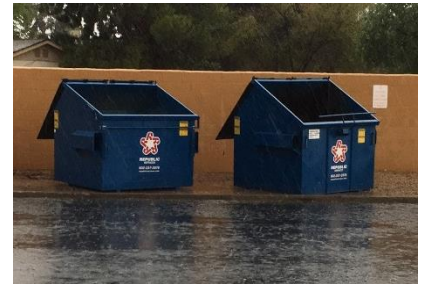
Improper Waste Management

Tips for proper waste management include: bag and tie waste, no liquid wastes, keep lids closed, make sure dumpsters aren't overfilled, check that drain plugs secure, keep area around dumpster clean. Following these tips will help manage pests and other issues. Call your solid waste service provider for service if your bin is damaged, rusted or leaking. If your bin is regularly filling up before pick-ups call for a larger bin or to schedule more frequent service. In general, now is a good time to make sure everything on your site is secure, covered so not to be blown or washed away by the weather.