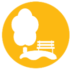
Quality of Life