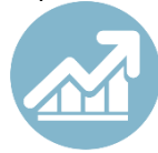
Financial Stability & Vitality