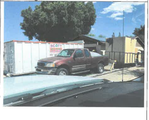
May 1, 2019: Roll off bin but not construction work. Storing debris.