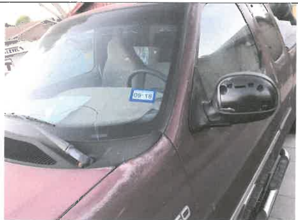
June 25, 2019: Unregistered vehicle on property for a year.