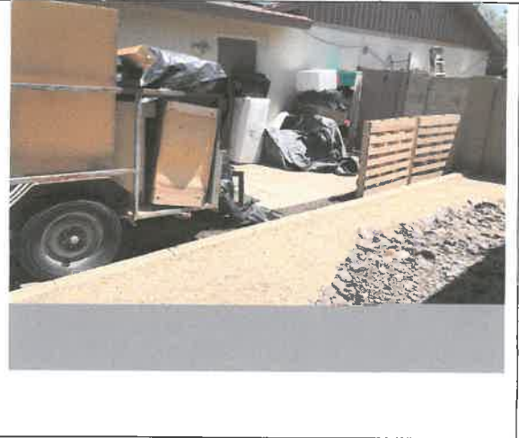
May 1, 2019: Continue to add more debris