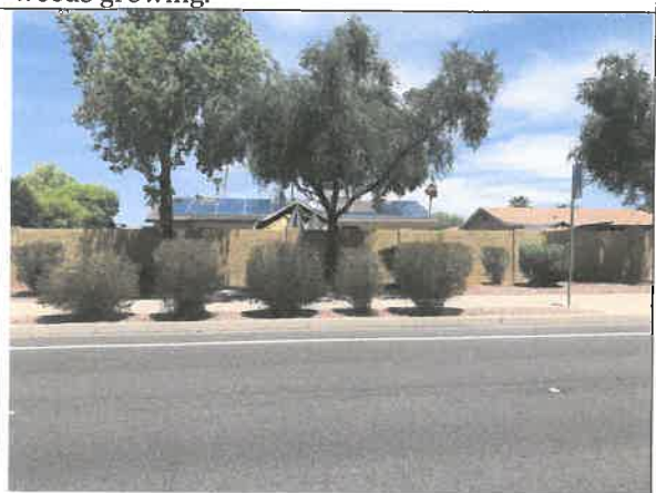
August 3, 2019: Backyard structures falling apart and debris is going into our backyard during winds.