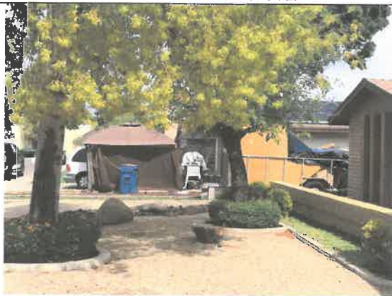
August 3, 2019: Unauthorized structure and trailer still between homes.