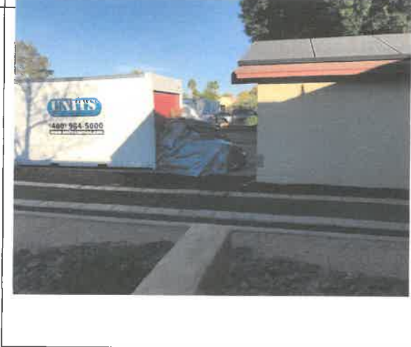
January 21, 2018: Storage remaining on property.