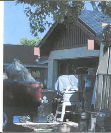
June 25, 2019: Garage is filled with debris to top and debris in front still. Fire hazard.