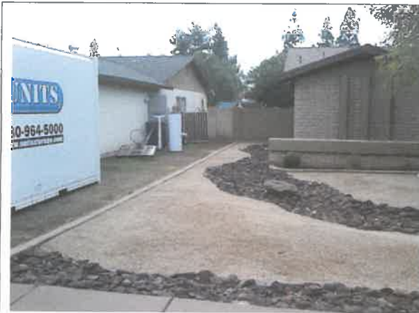
December 18, 2011: storage container on property for over a year.