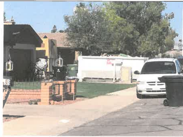
June 25, 2019: Roll off bin and debris on property.