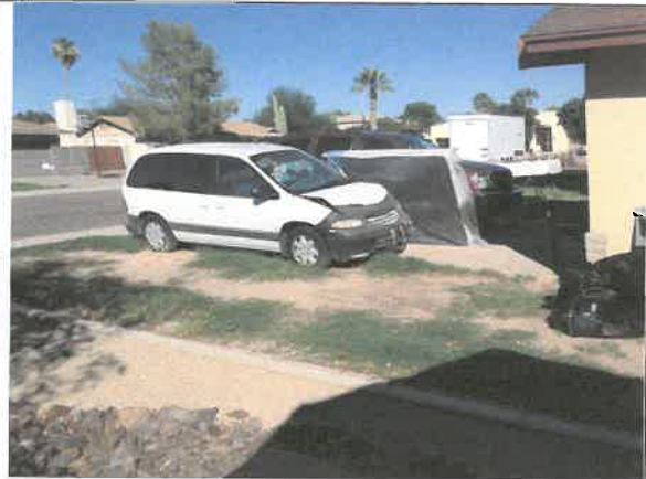
August 21, 2014: Began stockpiling debris