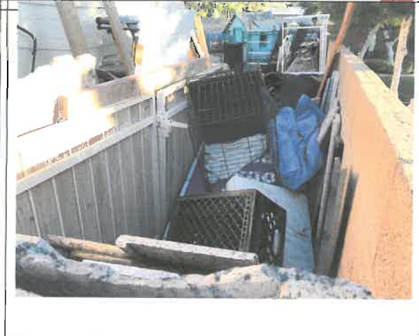
January 31, 2018: Debris build up possible fire hazard and stress against wall.