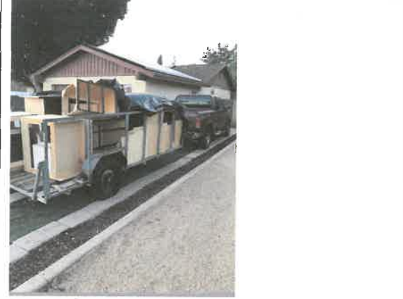
September 10, 2018: Truck and trailer brought on property with debris. Call the city.