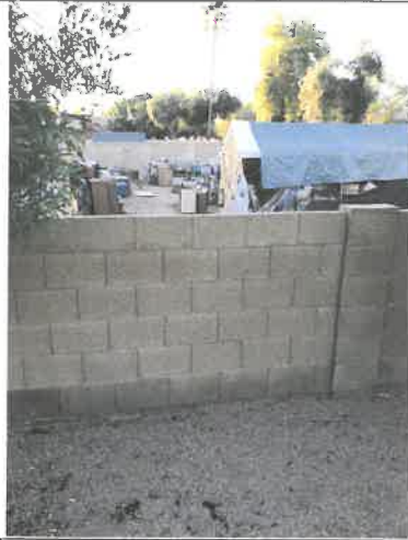
May 29, 2019: Continue to pile more debris in backyard and under falling apart structure.