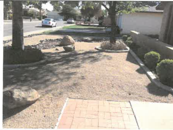
March 7, 2013: Normal