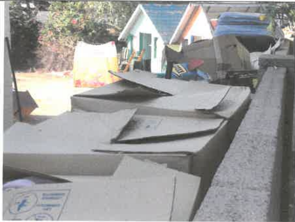
May 14, 2012: Debris in built up along fence and in backyard. Nesting area for insects and creatures.