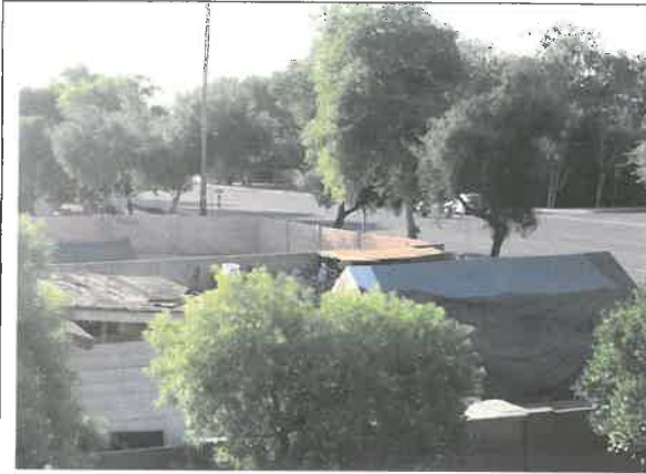
July 17, 2019: Unauthorized storages and patio fill with debris. Fire hazard.