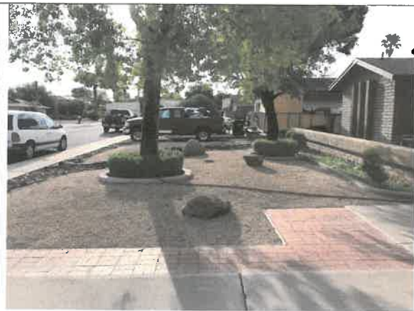
June 25, 2019: Trailer has not moved leaving little distance in the event of a fire. Fire code.