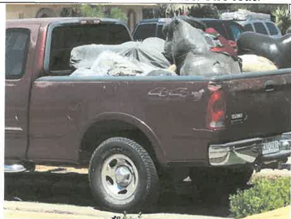
July 20, 2019: Truck with debris as storage and weeds growing.