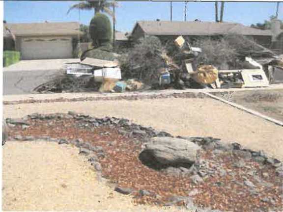
June 20, 2013: Pile debris in front of our yard as aggressive nature.