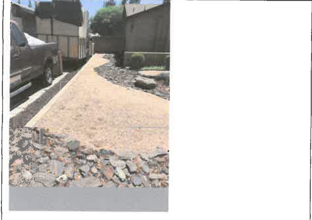
May 1, 2019: Continue to pile debris in trailer and not meeting fire for distance between homes.