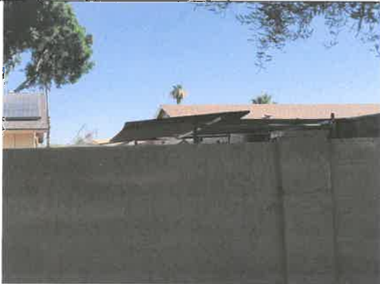
June 25, 2019: Unauthorized structure made of pile wood and leaning against fence with debris.