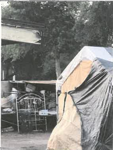
June 25, 2019: Makeshift storage against wall with debris and other storage structure falling apart with debris.