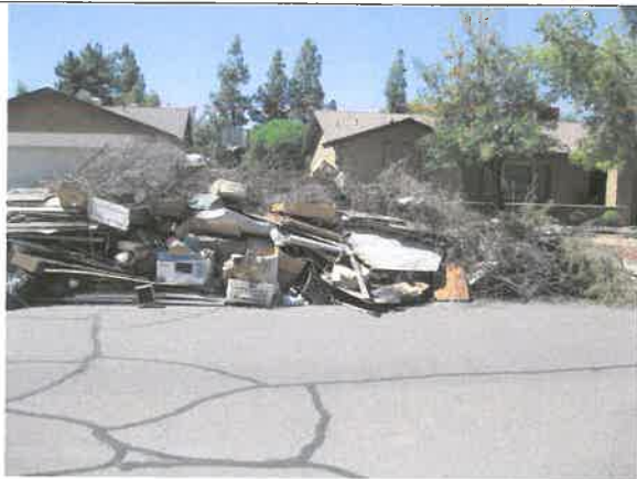
June 20, 2013: 6 feet tall debris