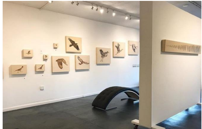
Lexie Bowers artwork (burnished wood and colored pencil on panel)