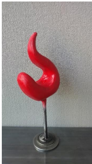
Ryan Shea Proposal for TBP