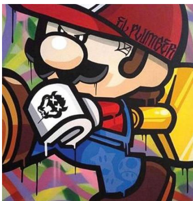
Exhibit runs through Sunday, November 29

Visit the exhibit to learn about favorite local arcades, see vintage game systems, play classic arcade machines and discover what is next in the world of gaming.