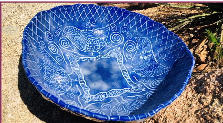
Ceramics: Terri Blau