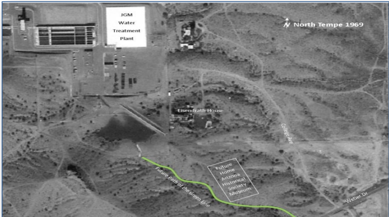
Aerial Photo of North Tempe in 1969

In the 1960s, the area that would become known as the Green Line was an ephemeral desert wash located in Papago Park in North Tempe. Typical of Arizona’s Sonoran Desert landscapes, the area was primarily populated by cactus, mesquite and creosote bushes that received little to no water aside from the occasional monsoon storms or winter rains. In 1967, the City of Tempe built a water treatment plant, Johnny G. Martinez Water Treatment Plant (JGM), in the area to treat water from the nearby canal in order to produce potable water for the growing community.