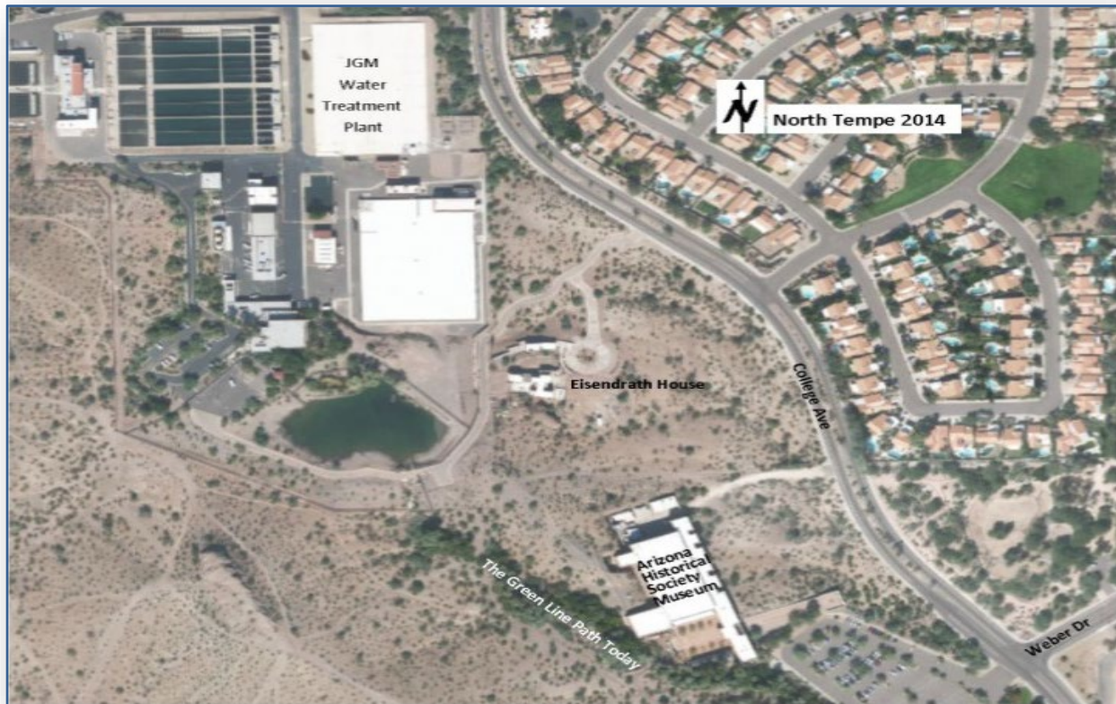
Aerial Photo of North Tempe in 2014

2000, Tempe entered into an agreement with the Arizona Historical Society Museum (c2003-159) to maintain the Green Line and supply it with water to maintain the lush riparian habitat that residents had become accustomed to. At the same time, the City's Water Utility received a $229,152 grant from the Arizona Water Protection Fund Commission to operate and maintain the Green Line. The terms of the grant (00-114b WPF) required the City to maintain the Green Line for 20 years, identify a "long-term supply" of irrigation water for the area and complete specific vegetation maintenance related activities. The required tasks were completed by 2006 and funding from the grant was exhausted in the process.