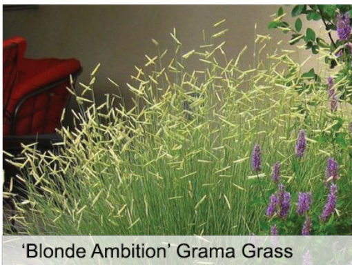
'Blonde Ambition' Grama Grass