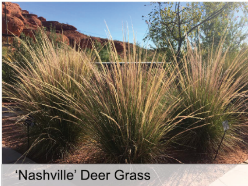
'Nashville' Deer Grass