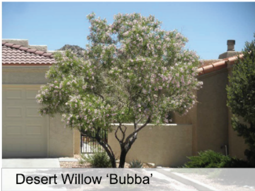
Desert Willow 'Bubba'