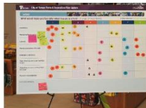
8 Plan Principles & Strategies for Our Future