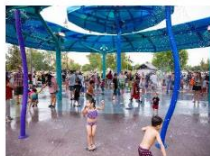
2 Recognition & Table of Contents