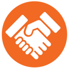
Strong Community Connections