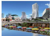
7 A Parks & Recreation System for Our Future