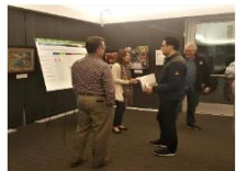
4 Parks & Recreation Master Plan Process