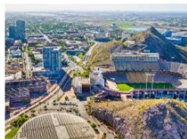
5 About Our City