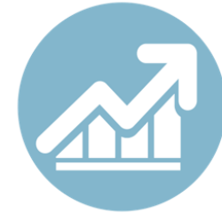
Financial Stability & Vitality

3.16 Achieve ratings of "Very Satisfied" or "Satisfied" with the "Quality of City parks, recreation, arts, and cultural centers" greater than or equal to the top 10% of the national benchmark cities as measured in the Community Survey.