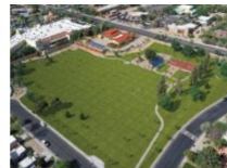
9 Implementation & Finance