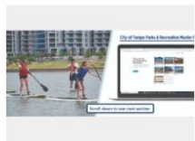
1 How to Use This Plan

The Tempe Parks & Recreation Master Plan Update includes Principles & Strategies to guide management, programming & development of Tempe's parks & facilities to the community. Click on any section to view or print it.