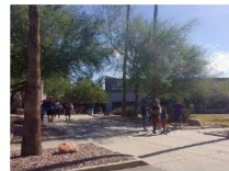
6 Our Parks and Recreation System Today (2020)