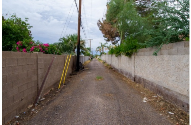
Cavalier Hills Alley before rehabilitation.