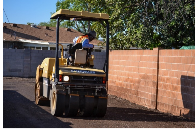
Municipal Utilities staff operating the motor grader (above left) and roller (above right), two of the pieces of equipment used to recondition alleys.

Staff also used the Cavalier Hills Alley Rehabilitation Project to launch the Alley Quality Index (AQI) rating system. Inspired by the City's Engineering and Transportation Department's Pavement Quality Index, AQI will prioritize alleys for maintenance based on objective scoring for the following criteria: surface condition, overgrown vegetation and weeds, graffiti and garbage/debris. The baseline score for alleys in Cavalier Hills before the rehabilitation was "average." Following the rehabilitation project, the AQI score increased to "excellent." This baseline data will be used to categorize each alley as excellent, good, average or poor, and this rating criteria will be used to prioritize alleys for maintenance.