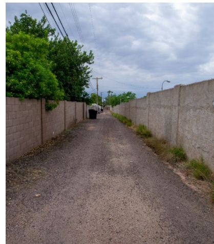
Overgrown vegetation and weeds in a Cavalier Hills alley before rehabilitation.

In 2014, the Solid Waste Section of the former Public Works Department was assigned management of the City's Alley Maintenance Program (AMP). Over the ensuing years, the program was unable to consistently meet the service level expectations of the community due to resource constraints and other contributing factors. In August 2021, the Municipal Utilities Department explored a new, comprehensive approach to alley maintenance in North Tempe's Cavalier Hills neighborhood. This tactic placed emphasis on reconditioning and resurfacing unpaved alleys, while determining the resources needed to recondition 40 miles of alleyway each year, educating the community on its role in maintaining alleys and creating a partnership with the community to improve and maintain Tempe's alley system.