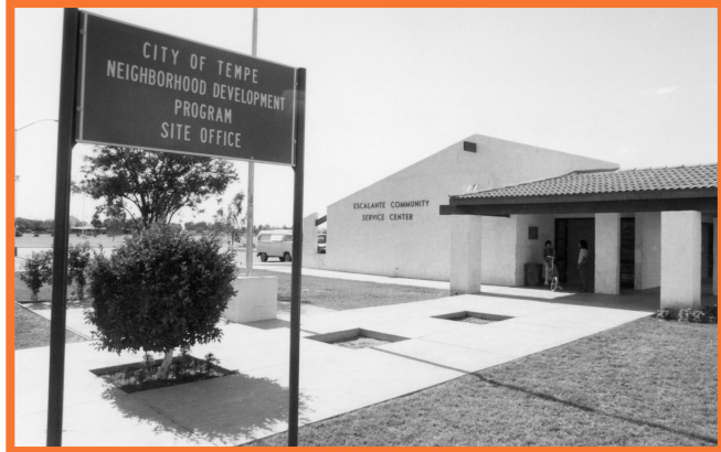
Escalante in 1971

In the late 1960s, a local community action program provided adult and youth education, employment, and recreation services. In 1969, an additional youth program was developed to keep kids in school as a means of drop-out prevention. In May of 1971, the city of Tempe took over the management of the youth program, named the Youth Assistance Program, and opened the Escalante Community Center. Escalante also served as the home to the Tempe Community Action Program, known today as the Tempe Community Action Agency (TCAA).