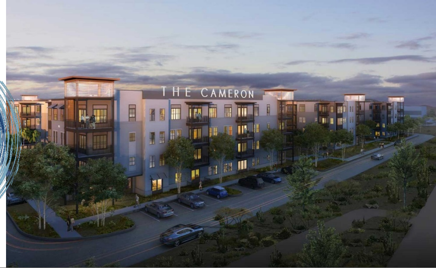
The Cameron by StreetLights Residential - 2062 E Cameron Way