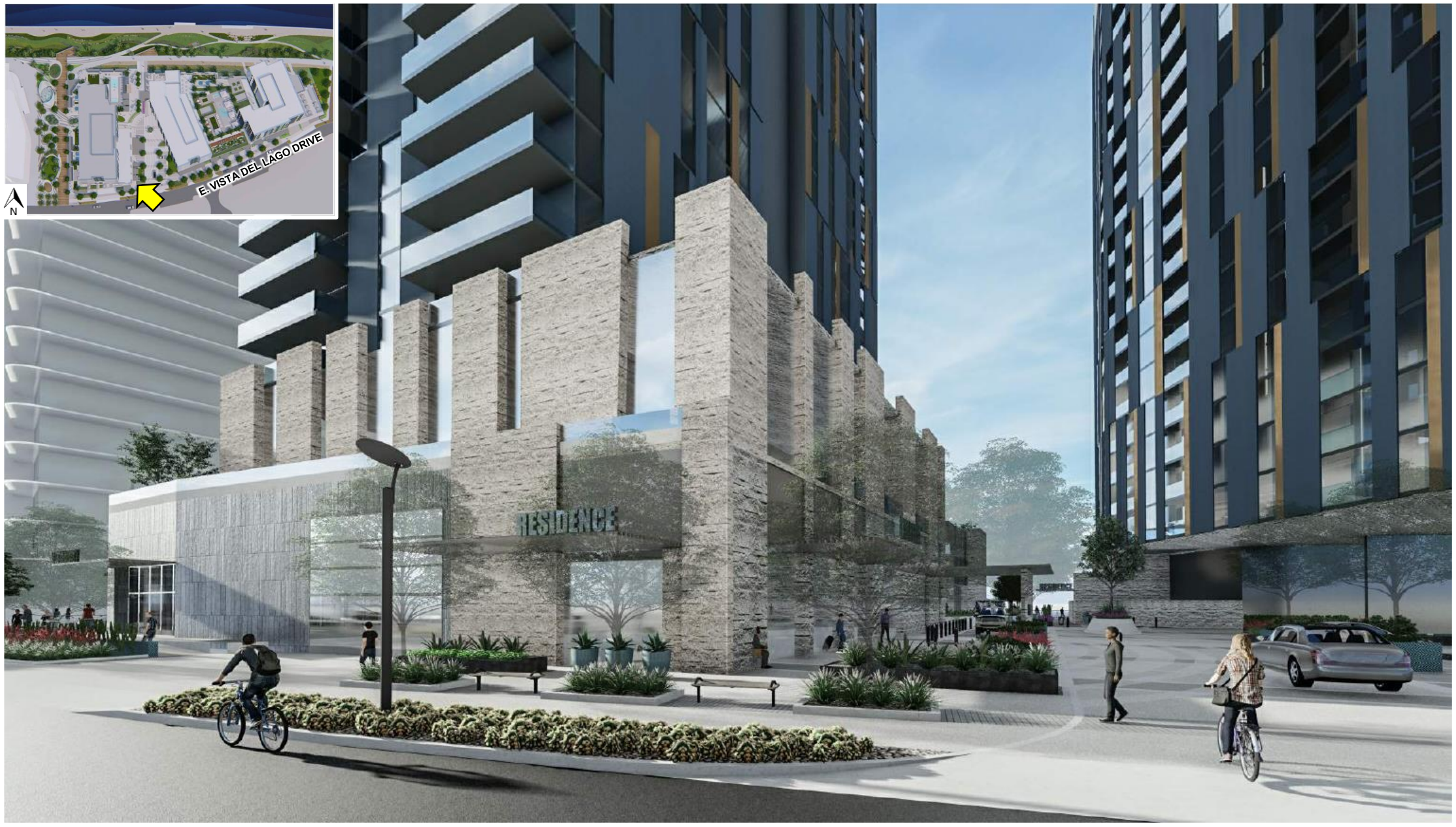
PHASE I RENDERING LOOKING NORTHWEST FROM VISTA DEL LAGO DRIVE