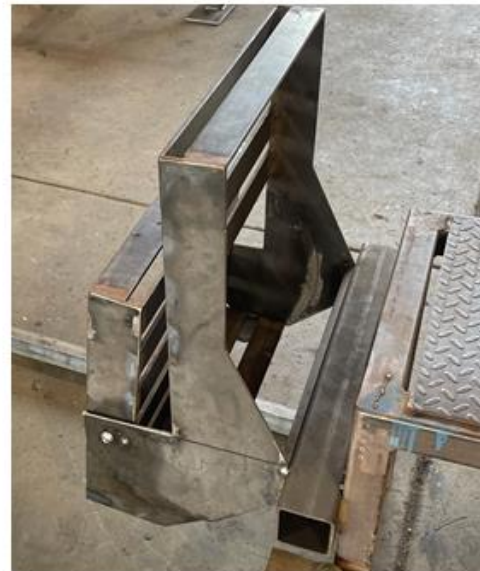
custom flip down seat