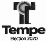
Exhibit A - 2020 General Election Canvass