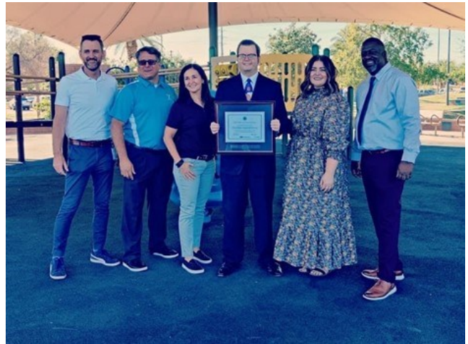
Community Services Ribbon Cutting with our Certified Autism Center Award at audited and certified park, Kiwanis Park

On May 10, 2021, the Community Services Department received the CAC accreditation with 80% of all department employees successfully completing an online training that focused on learning about those with autism, the neurological aspects of the diagnosis and how to best support this population and their families as they travel and live in our city.